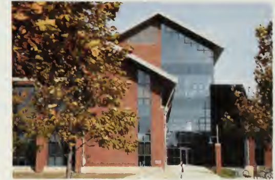
Workforce Development Center at Heartland Community College in Normal was the first state-funded LEED project in Illinois. Heartland has applied for LEED Silver certification.

Determining the operating and maintenance costs of various design options is not simple. Making a wise decision is difficult because the initial construction cost and life cycle maintenance costs among various design options can often differ dramatically. Analysis of these options during the early stages of design will lead to informed decisions resulting in the design, construction, and operation of a more energy efficient building. SEDAC can provide this assistance for you whether you are a business owner, public facility operator, contractor, architect, or engineer.